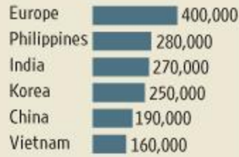
Unauthorized immigrants, 2006

Note: Selected countries and regions outside of Latin America